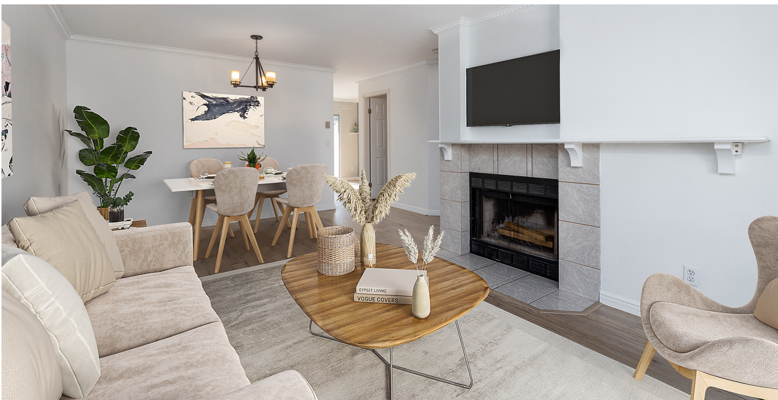
kitchen island and furniture virtually staged